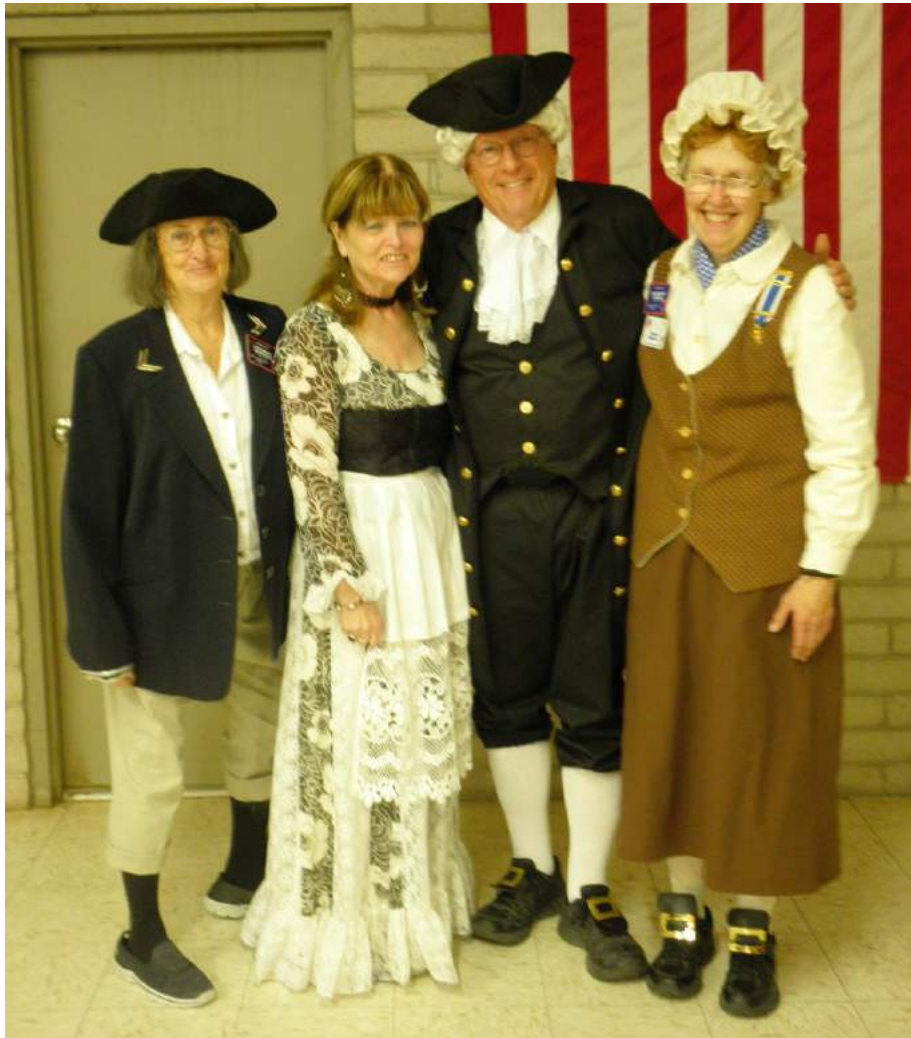
George Washington's Birthday Party 2018