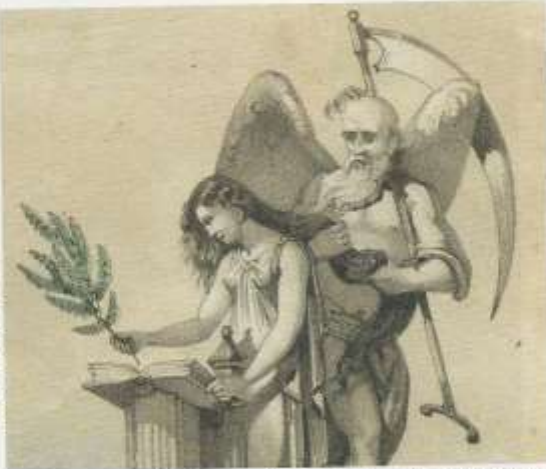
Illustration: Detail from Book of the Lodge (1855)

A weeping virgin, holding a sprig of acacia in one hand and an urn in the other, before her is a broken column on which rests the Book of Constitutions, while Father Time is behind her unbraiding and counting the ringlets of her hair.